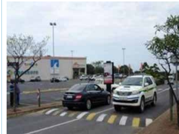
PAVE AD 2