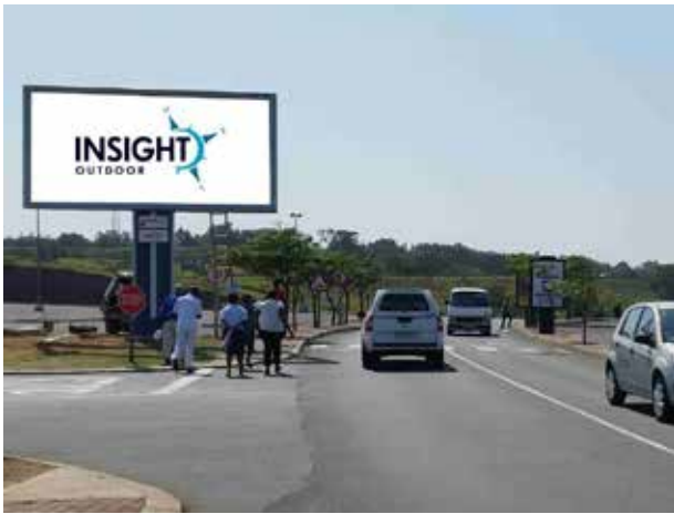
BILLBOARD – ISD 001