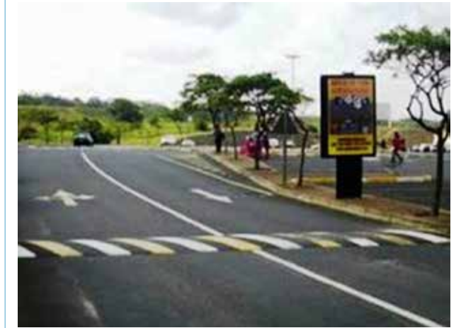
PAVE AD 3