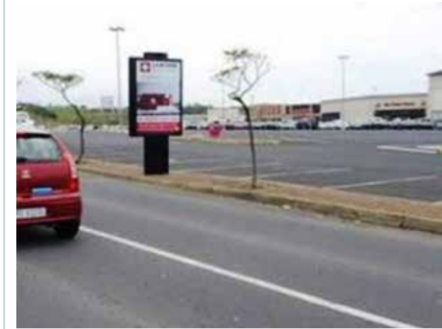
PAVE AD 3